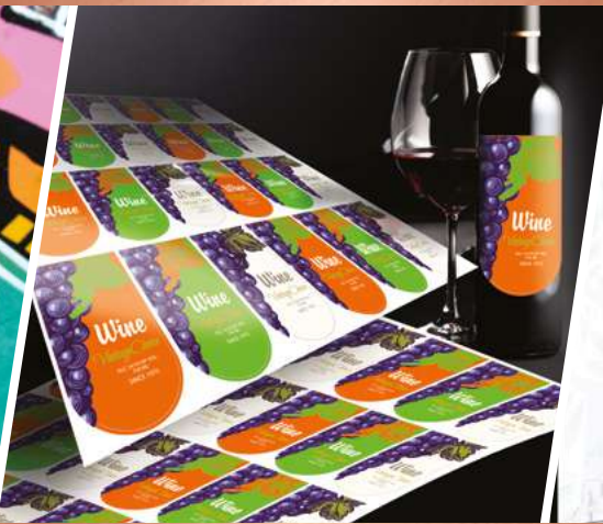
CONTOUR CUT LABELS