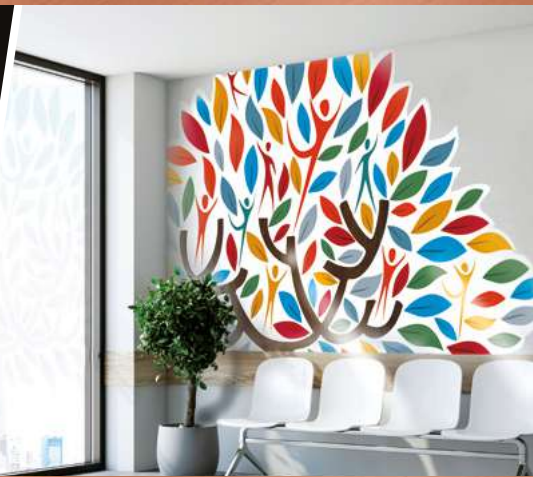
WINDOW AND WALL GRAPHICS