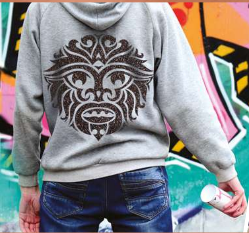
HEAT TRANSFER APPAREL